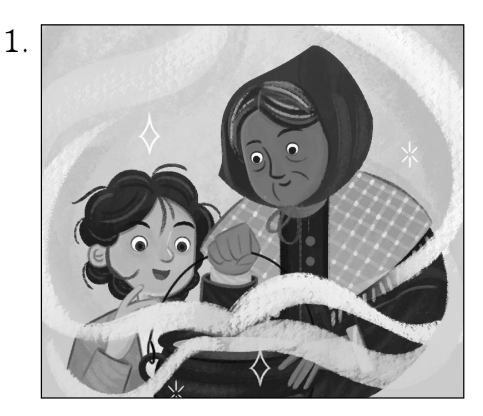
"When you are ....., say 'Cook, little pot, cook.'"

Choose the right word to finish each sentence.