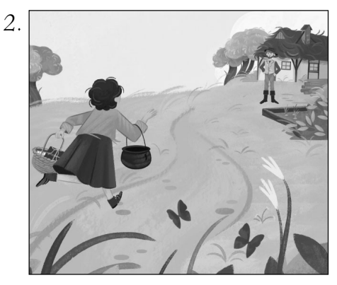
"Look, Father, I have all your things from the ....."