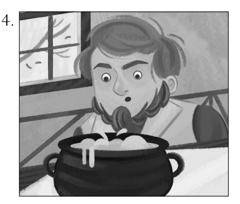
The pot is ..... making more porridge.