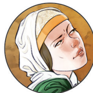
C. Lady Macbeth