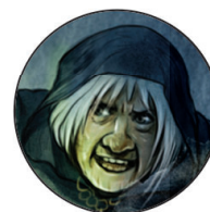
F. The witches