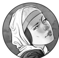
C. Lady Macbeth