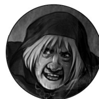
F. The witches