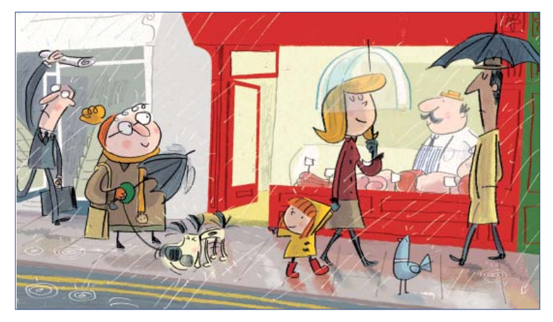
© 2011 Usborne Publishing Ltd. Not for commercial use.

You could also recreate the story as a local newspaper report, with quotes from Bob and Old Mother Hubbard and a picture of Mother Hubbard and Spot.