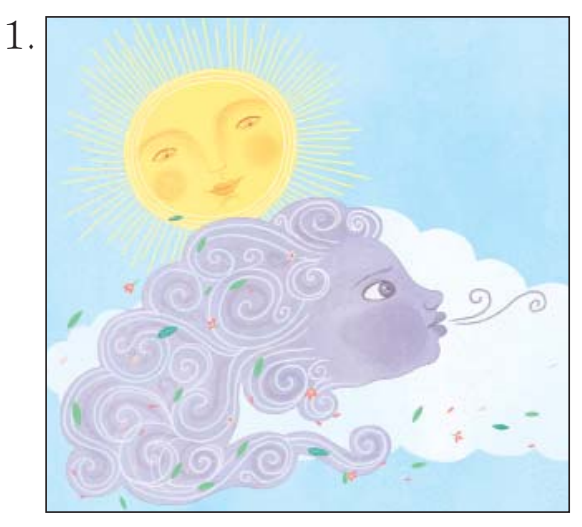
The Wind isn't .....