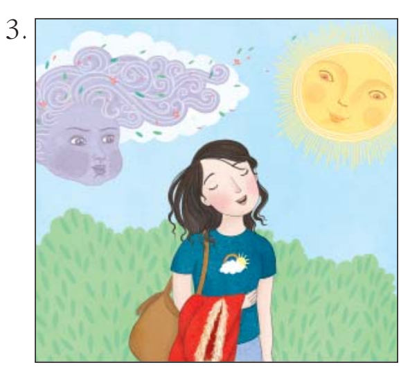
The Sun is .....