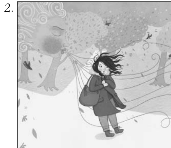
The girl is .....