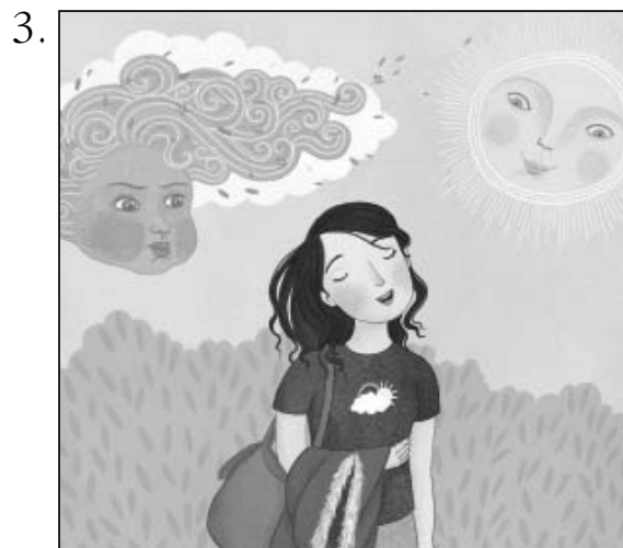
The Sun is .....