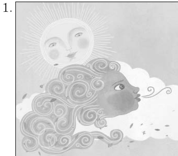
The Wind isn't .....