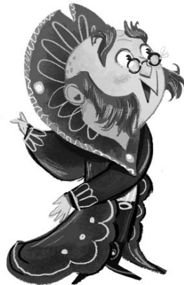
4. The Wizard of Oz