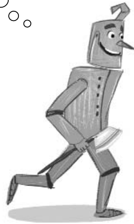
The tin man