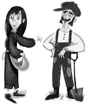
2. Aunt Em and Uncle Henry