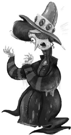
5. The Wicked Witch of the West