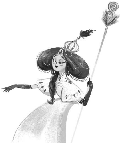
3. The Good Witch of the South