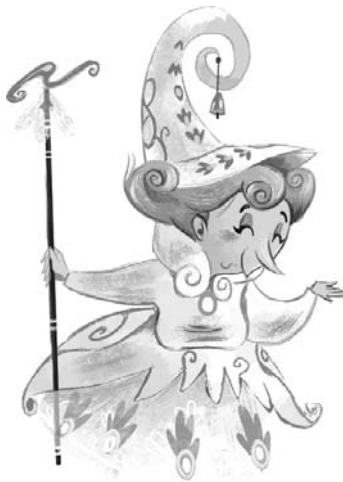
6. The Good Witch of the North