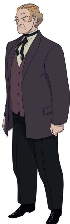
Professor van Helsing