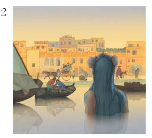
The next day, the oldest princess swam ..... to the sea's surface.