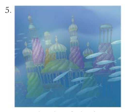
Was that her father's palace, far .....?