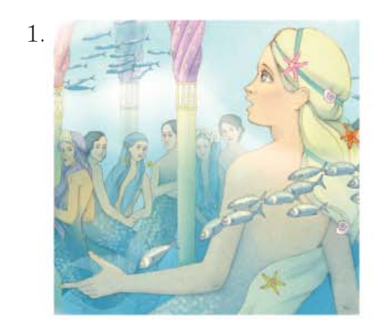
There was a wonderful party ..... the palace.

Choose the right word to finish each sentence.