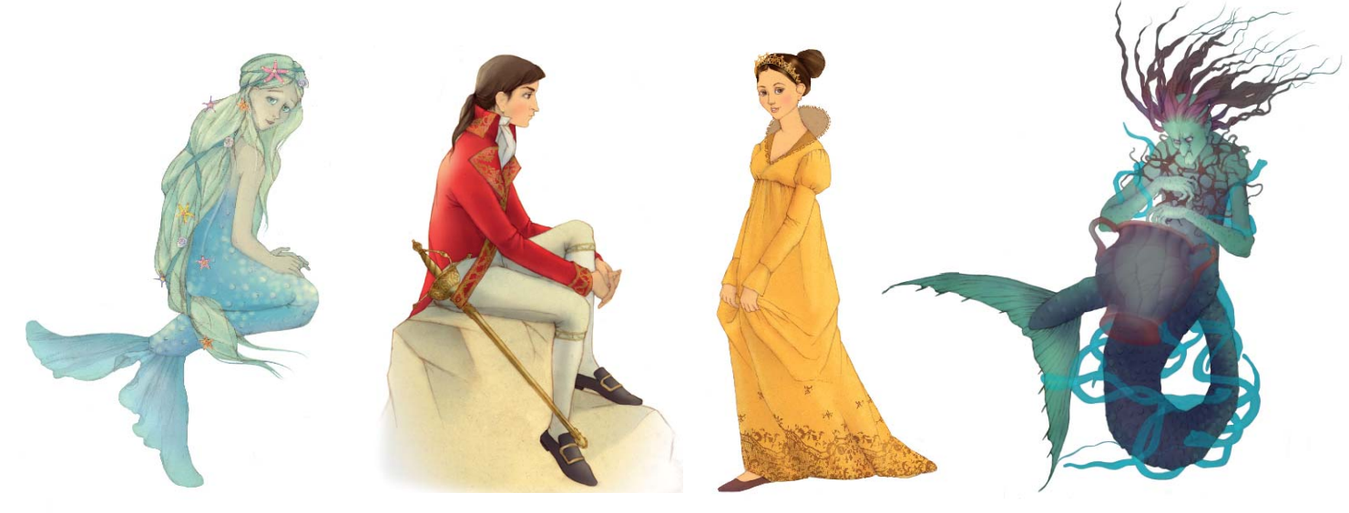
The little mermaid... The prince... The princess... The sea witch...

A. ...finds a stone statue after a shipwreck.