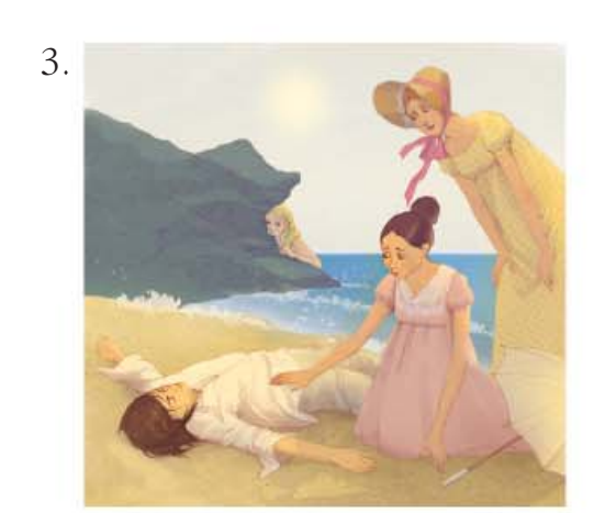
Soon some girls came down to the shore, and saw the prince ..... the sand.