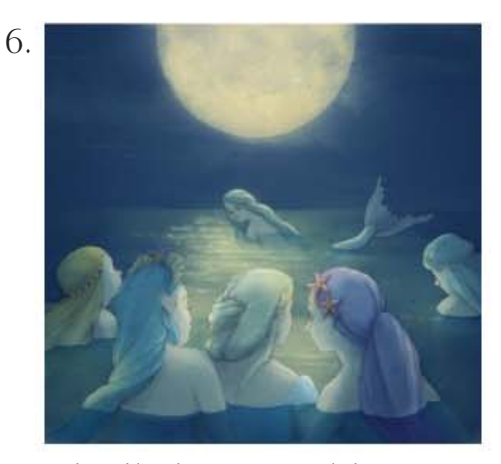
The little mermaid jumped ..... the water.