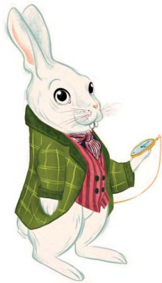
The White Rabbit...