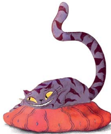
The Cheshire Cat...