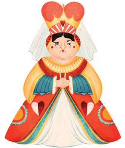
The Queen of Hearts...