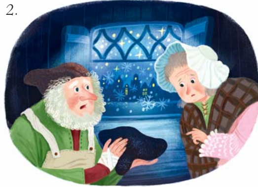
The shoemaker and his wife