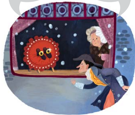
The rich stranger