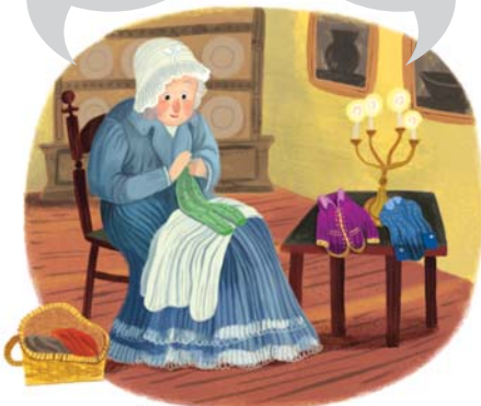
The shoemaker's wife