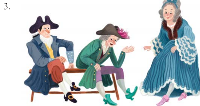
The stranger and his friends