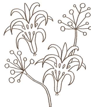
Leeks for Wales