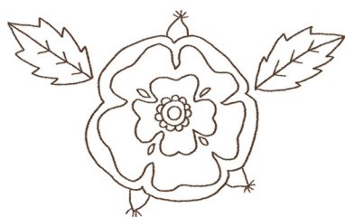
Roses for England

The Queen's Coronation Dress was made from ivory silk, decorated with beads, sequins and pearls, and embroidered with flowers and plants representing the countries under her rule.