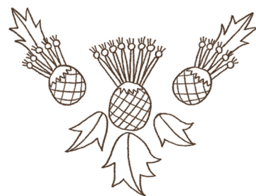
Thistles for Scotland

Purple robe embroidered with gold, and trimmed with ermine fur