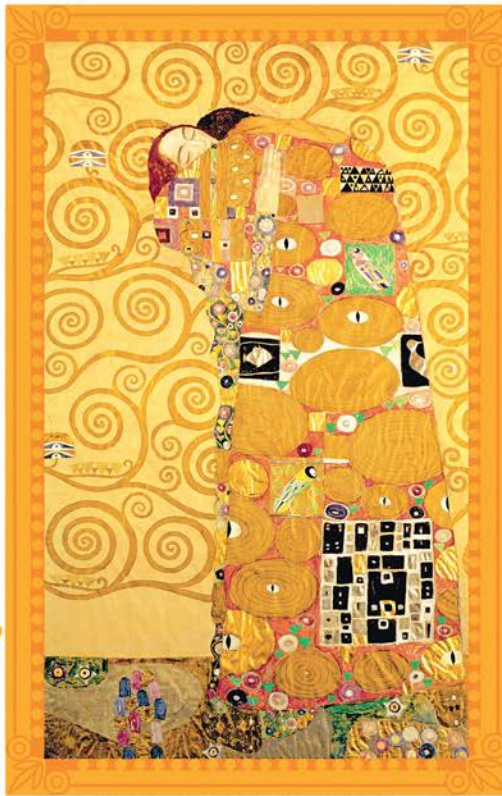
The Tree of Life by Gustav Klimt, 1905