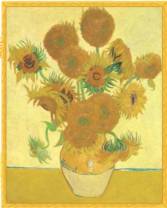
Sunflowers by Vincent van Gogh, 1888

This is one of a series of sunflower pictures Vincent van Gogh painted to decorate a room for a friend. Almost everything is yellow, which for Van Gogh was the colour of happiness.