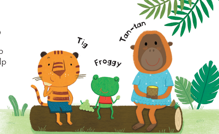
What we ate today

Lep doesn't have room to draw every single thing the animals ate.