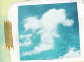
Gdansk, September 15

You could keep your own log of the different clouds you see. Record where and when you spotted each one.