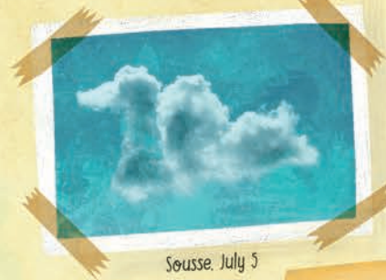
Sousse, July 5

You could keep your own log of the different clouds you see. Record where and when you spotted each one.