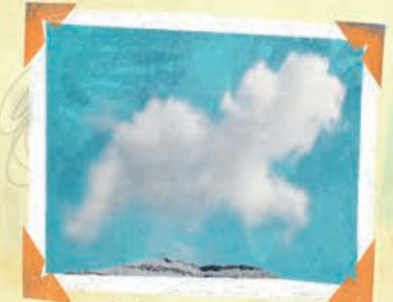
Aosta, September 23

- If you're with friends when you spot a cloud that looks like something, you could challenge them to guess what.