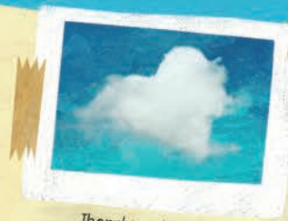
Thornham, August 17

Sometimes clouds have strange shapes that remind you of other things. What shapes can you see in these photographs?